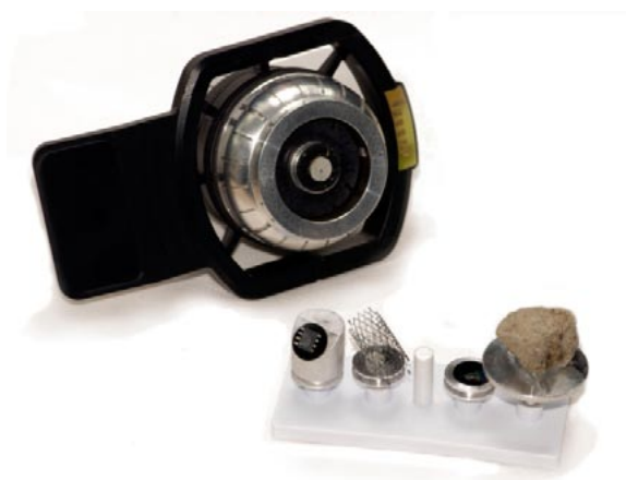
Figure 1: Phenom Sample cup and holders

The Phenom helps balance the workload on existing SEMs while increasing schedule efficiency. It increases a lab's overall magnification capacity by offloading routine work from the SEM at a cost level traditionally associated with an optical microscope.